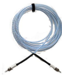
Distance Cable with PTFE sheath and spiral tube