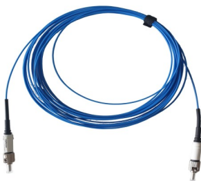
Distance Cable with PTFE sheath