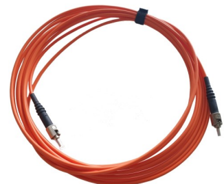
Distance Cable with PVC sheath